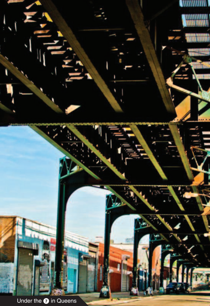
Under the 7 in Queens