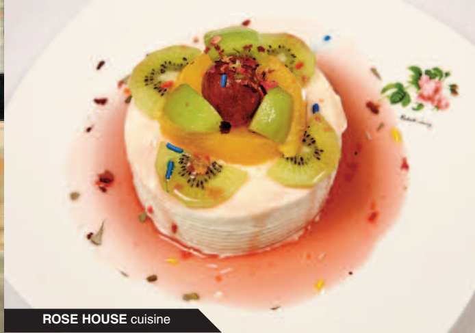
ROSE HOUSE cuisine

Live Performances by MTA Arts for Transit Music Under New York 3 to 6 PM, on the 7