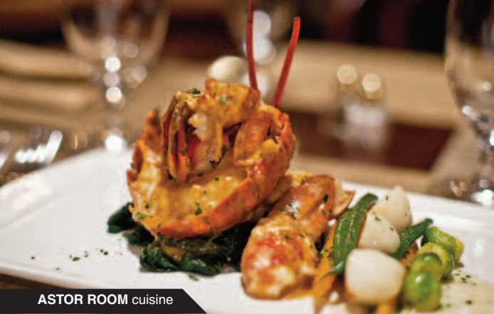
ASTORIA ROOM cuisine