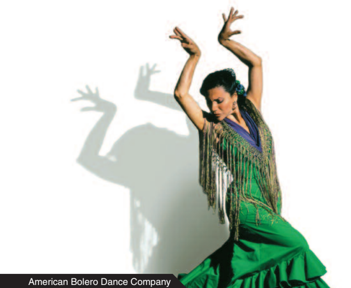
American Bolero Dance Company