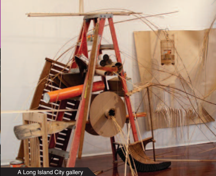
A Long Island City gallery

"Queens Art Express... showcases the coming of age of Queens as a hotbed of art..." New York Times